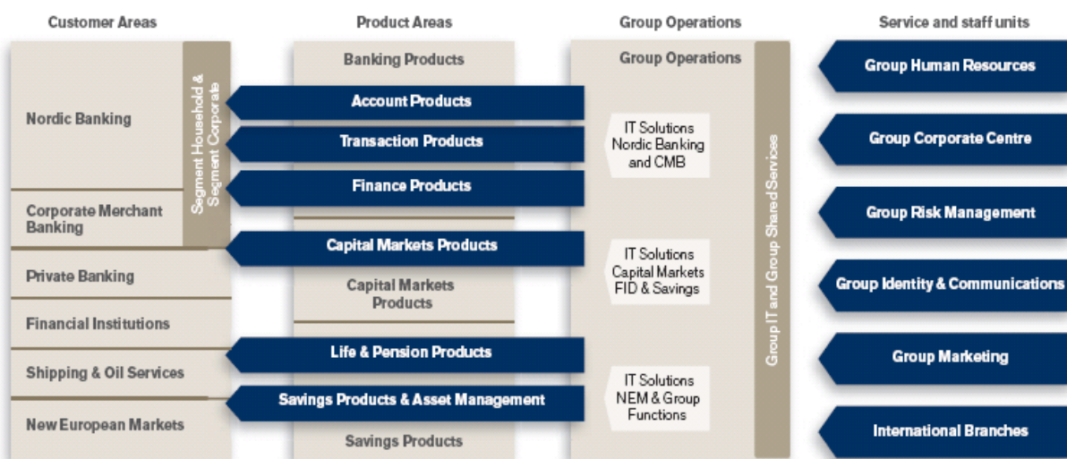
Integrated Group operating model

To serve its household customers and corporate customers, the Nordea Group has divided its operations into customer areas (Nordic Banking, Corporate Merchant Banking, Private Banking, Financial Institutions, Shipping & Oil Services and New European Markets) and product areas (Banking Products, Markets FICC and Saving Products), in addition to which the Nordea Group has Group Operations and Service and Staff Units: